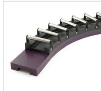
Single track version