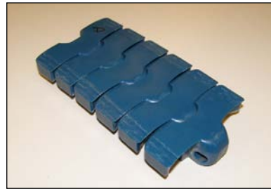
Marking on surface of the chain in abrasive applications