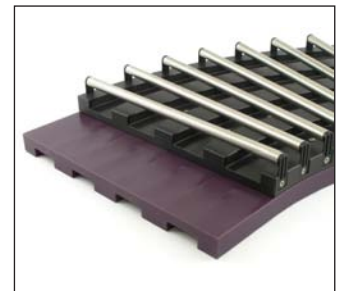
Multiple track version