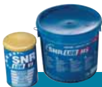
SNR LUB greases